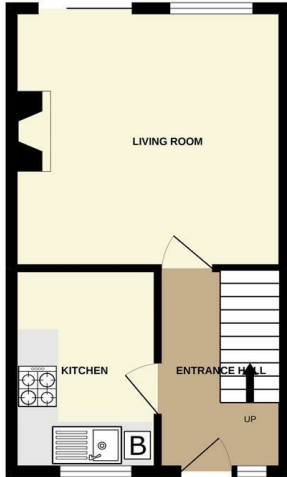
GROUND FLOOR 303 sq.ft. (28.2 sq.m.) approx.